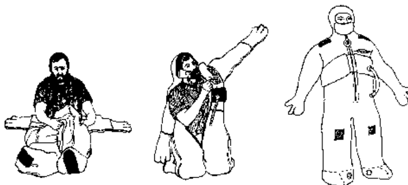
FIGURE 2. Donning an immersion suit

Your immersion suit works properly only when you are wearing it in the water. New safety regulations for documented vessels that operate beyond the boundary lines or with more than 16 people, require monthly drills and instructions for donning immersion suits. First attempts can be awkward and exhausting but with practice you should succeed in getting into a suit in one minute or less. Practice seated donning of suit. This will be the most convenient methods in actual high sea, emergency situation. The following is the instructions for practice seated donning of an Immersion Suit (Figure 2):